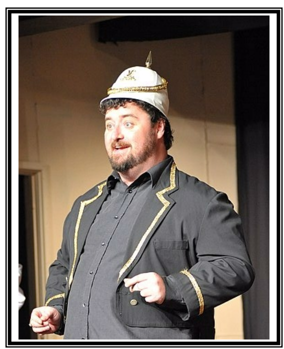
The Sound Of Music Performance Dates Nov 14, 15, 19, 21, 22, 26, 28, 29. Dec 3, 5, 6