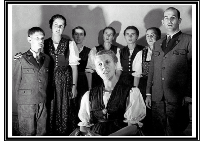
The Real Von Trapp Family (minus one!!)

Telephone (08) 9495 4688 1<sup>st</sup> Floor, 13 Page Rd, Kelmscott 6111 (Cnr Gilwell Ave)