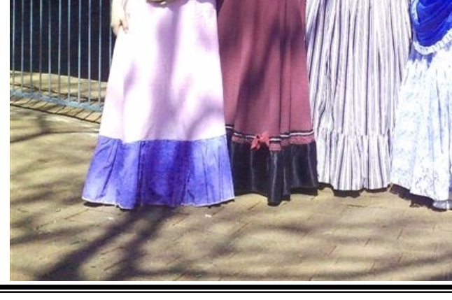
THANK YOU to all involved