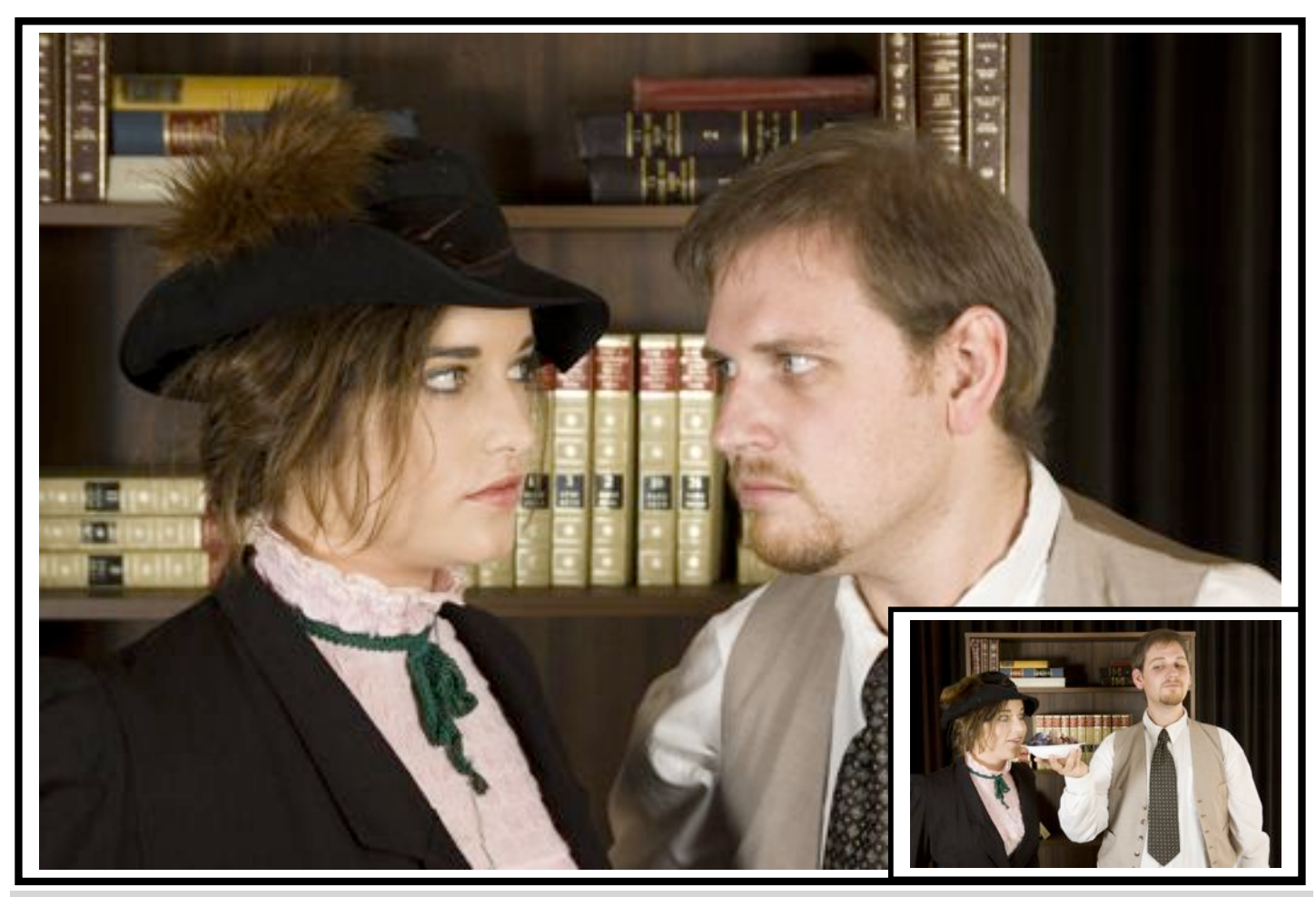
Book now as tickets are selling fast!

Submission Deadline: Please phone through or email your submissions for next month's callboy.