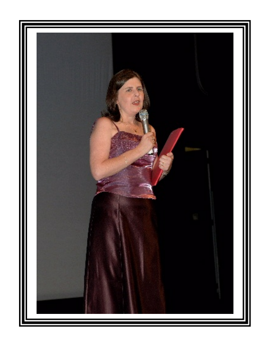
Best Musical 2005: Les Miserables Murray Music and Drama