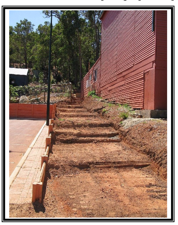
Below: Before and after shots from the 'Auditorium Makeover'

(Best seen if you get the callboy by email as they are colour!!)