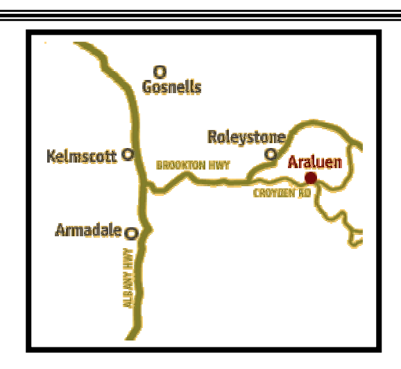
Directions to Araluen Botanic Park

PLEASE NOTE: There is no obligation to do so!!